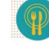
Exhibit Hall Meal Sponsor $6,500

Get your company on the bag of every ADED and NMEDA attendee. No cheap totes here, we protect your brand with a quality bag. Why? To give you continued brand exposure long after the event! You're welcome.